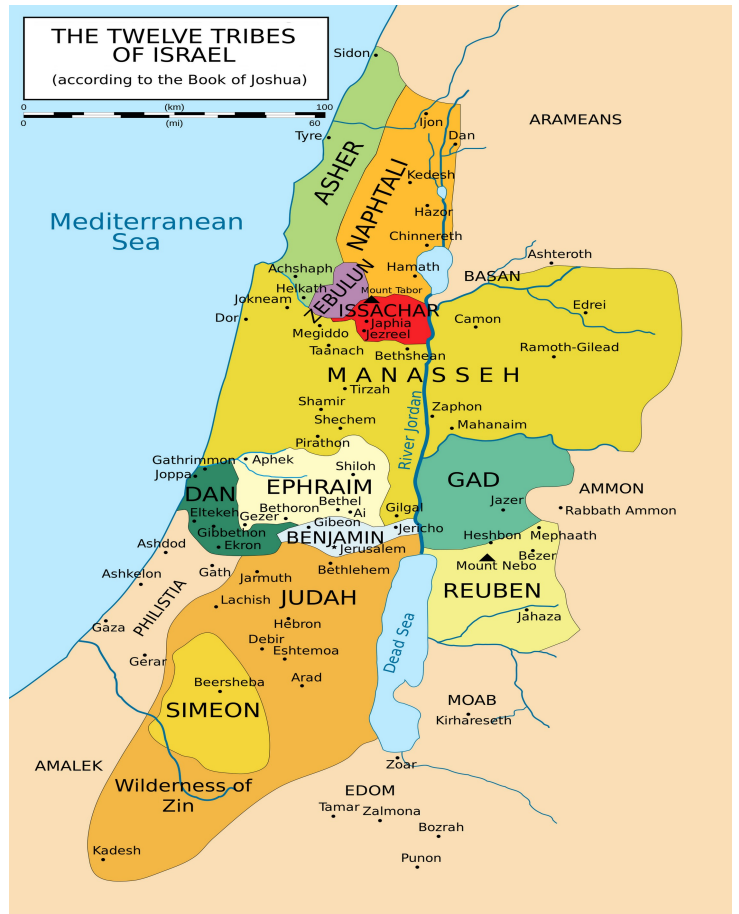
The Twelve Tribal Areas allocated by Joshua