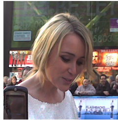
Keeley Hawes