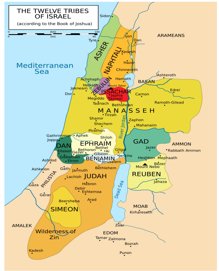
The Twelve Tribal Areas allocated by Joshua